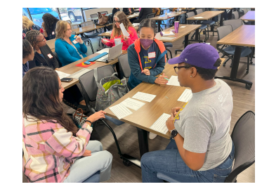
Fort Bend ISD Training

Three Independent School Districts, including Fort Bend, Pasadena, and Pearland, served as exemplary models of success in their partnerships with ChildBuilders. These districts demonstrated dedication by actively training their counseling staff in ChildBuilders' programs and championing the district-wide implementation of these initiatives. This year, they achieved success while striving to comply with new Texas laws governing the approval of child abuse prevention curricula in schools. We are grateful for their dedication to the well-being and safety of the children under their care.